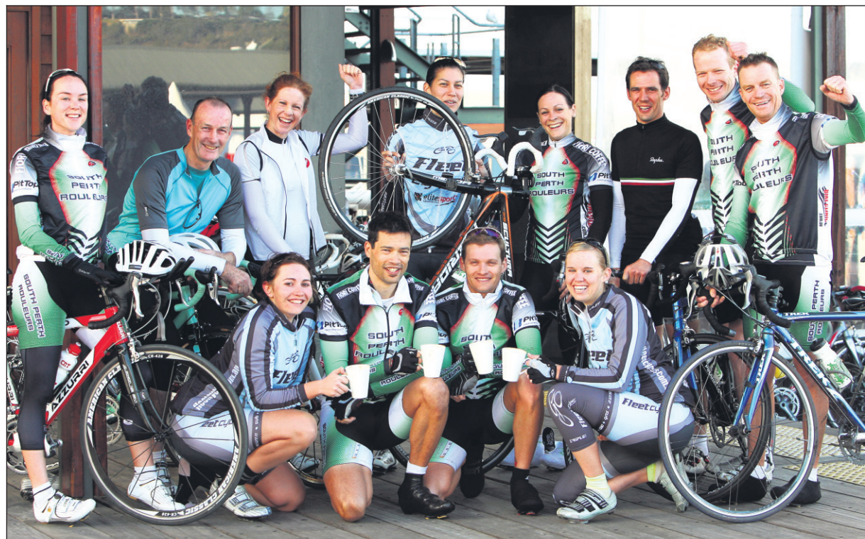
Warming to it: South Perth Cycle Club members enjoy a coffee at Barrack Street jetty after an early ride.